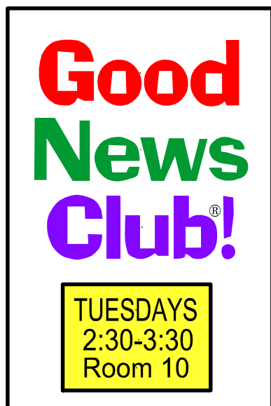
Sample layout of finished sign